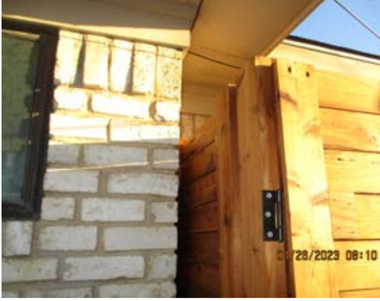
Conducive - Wooden Fence in Contact with the Structure (R)