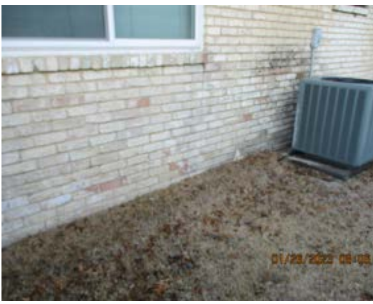
Conducive - Footing too low or soil line too high (L)