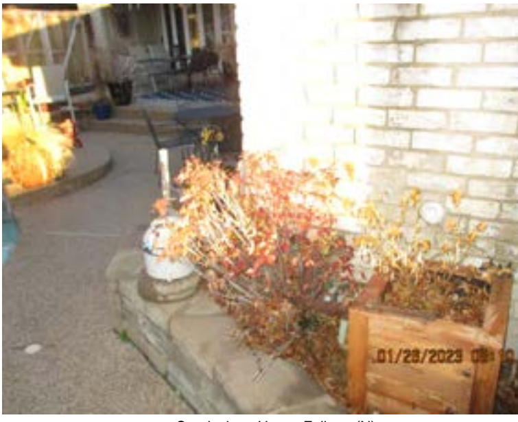
Conducive - Heavy Foliage (N)