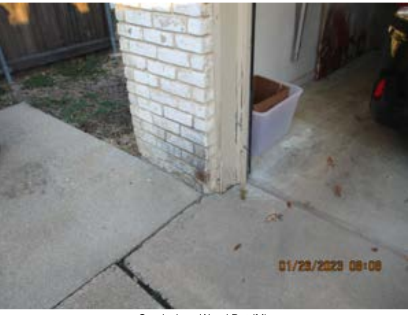
Conducive - Wood Rot (M)