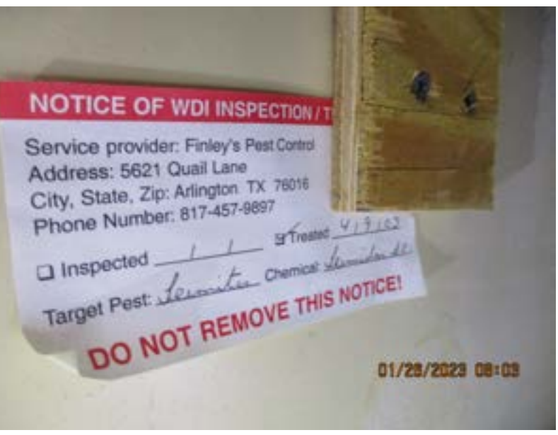
Previous - Subterranean Termites (11A)